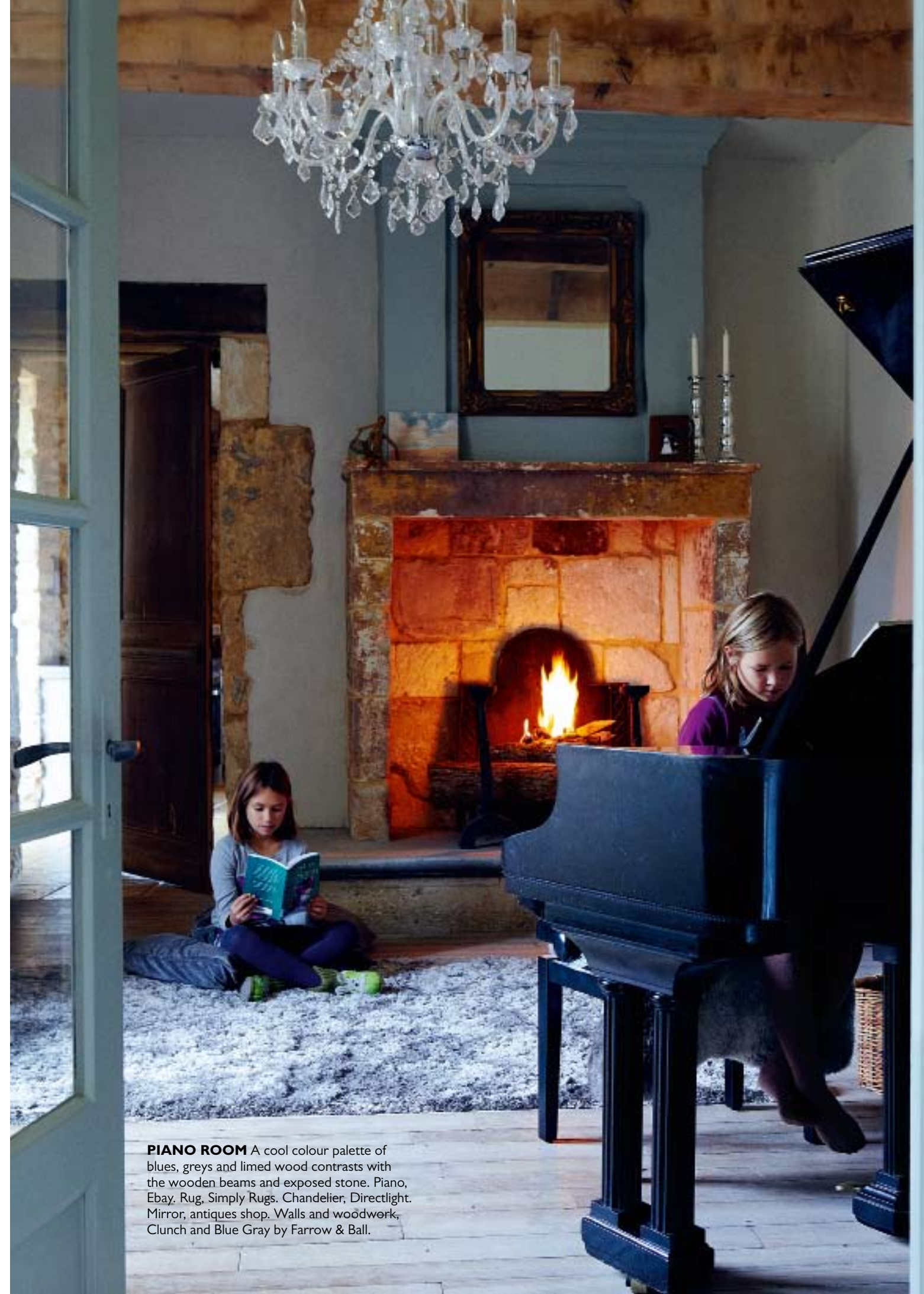
PIANO ROOM A cool colour palette of blues, greys and limed wood contrasts with the wooden beams and exposed stone. Piano, Ebay. Rug, Simply Rugs. Chandelier, Directlight. Mirror, antiques shop. Walls and woodwork, Clunch and Blue Gray by Farrow & Ball.