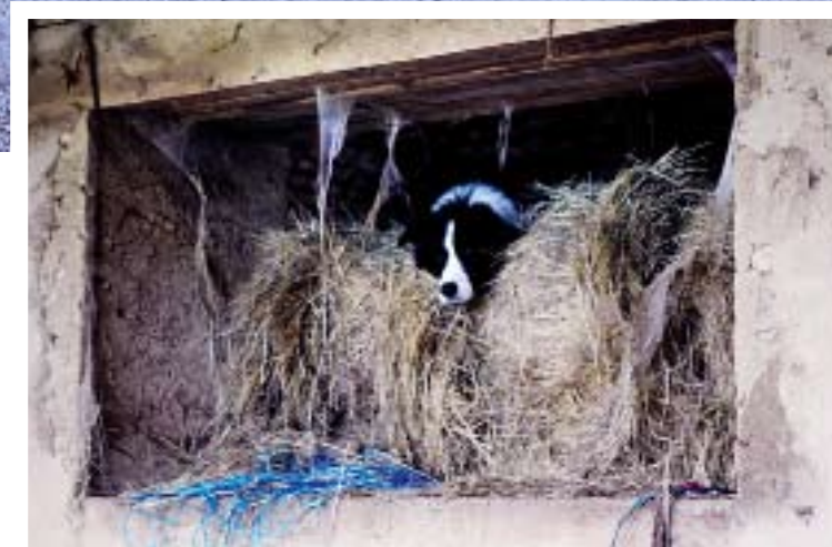
EXTERIOR The manor house and associated buildings date from the 1700s. The property is set in more than 100 acres of land, allowing the family to coppice their own wood and use it to heat the house. Misty the border collie peeps out from the barn (left).