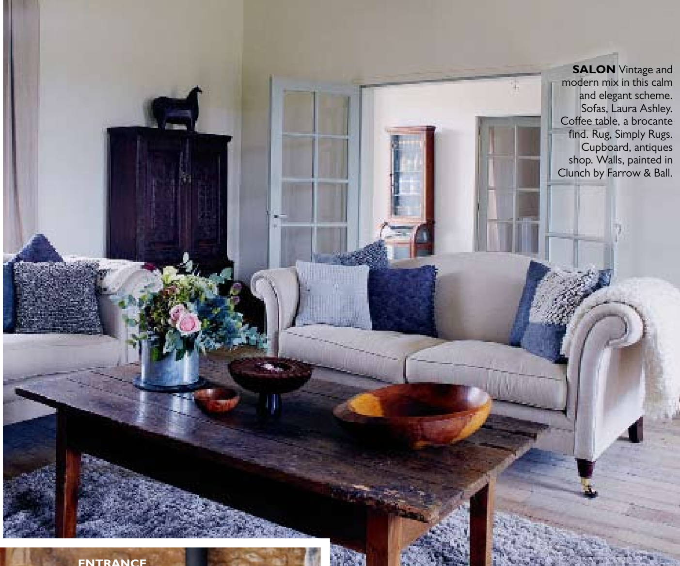
SALON Vintage and modern mix in this calm and elegant scheme. Sofas, Laura Ashley. Coffee table, a brocante find. Rug, Simply Rugs. Cupboard, antiques shop. Walls, painted in Clunch by Farrow & Ball.