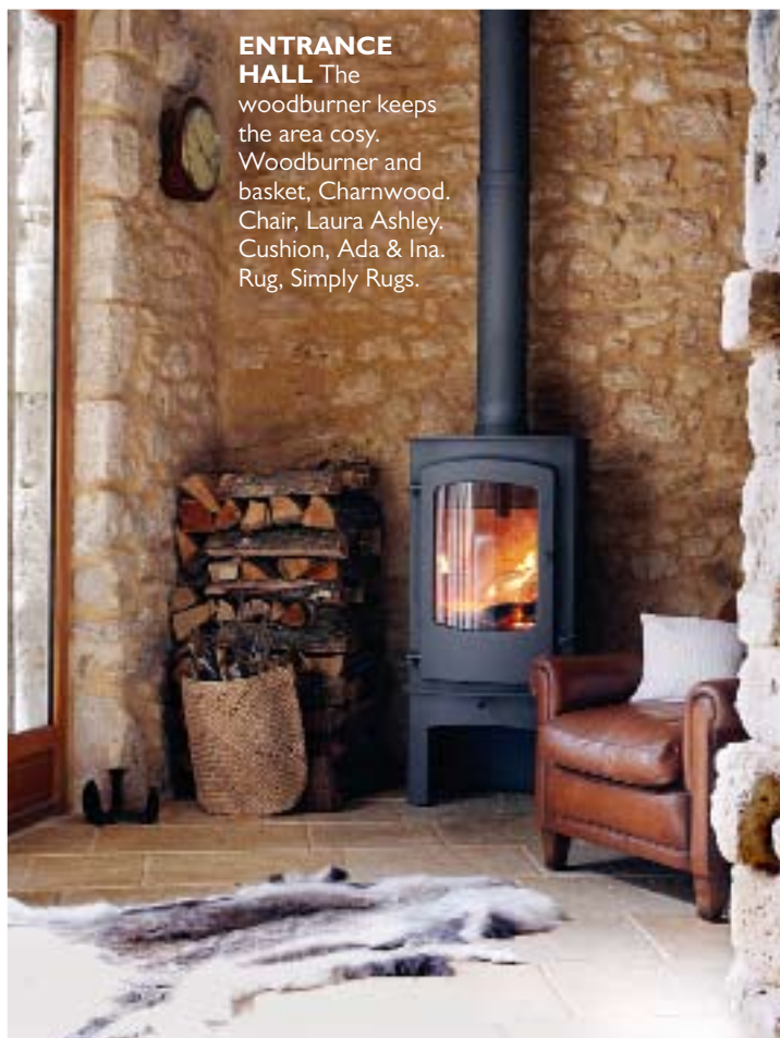
ENTRANCE HALL The woodburner keeps the area cosy. Woodburner and basket, Charnwood. Chair, Laura Ashley. Cushion, Ada & Ina. Rug, Simply Rugs.

such as wool, wood, leather and stone, and I have used a natural colour palette of greys and browns. The exterior shutters, for instance, are painted in a beautiful colour (Blue Gray by Farrow & Ball) that is very gentle, elegant and French.'